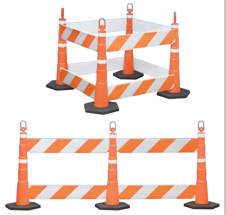
Navigator Channelizer Barricade does not meet ADA guidlines.

Retroreflective sheeting meets all state and federal specifications, and is available in Engineer, Hi-Intensity and Diamond grades.