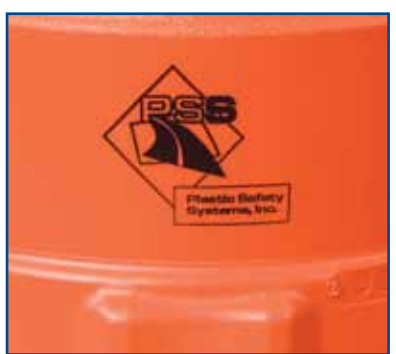
Compare "Hot Stamp" to the labor and material costs, and durability, of stencil.