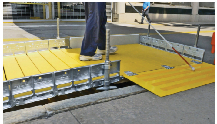
BoardWalk Ramp shown parallel to curb, with optional Platform on right.