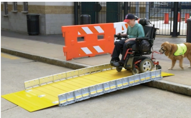
BoardWalk Ramp shown perpendicular to curb.

With BoardWalk Ramp, all pedestrians can more safely traverse through sidewalk construction.