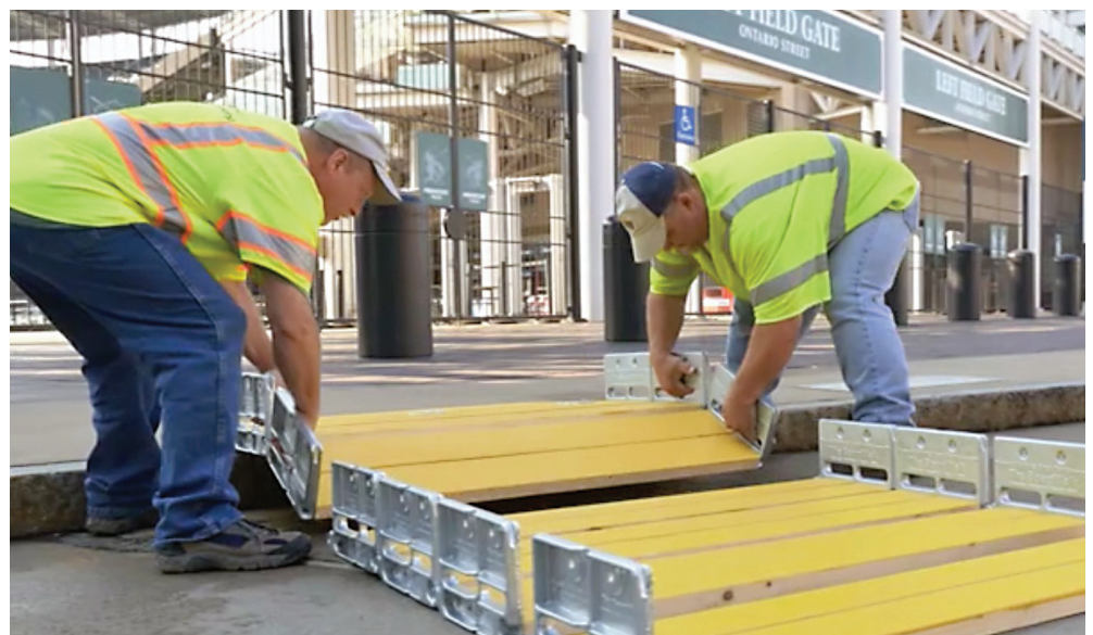
Modular sections assemble in less than a minute!