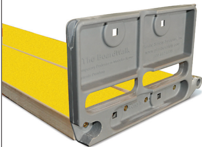
Each modular section consists of two Edge Support Castings and two boards.