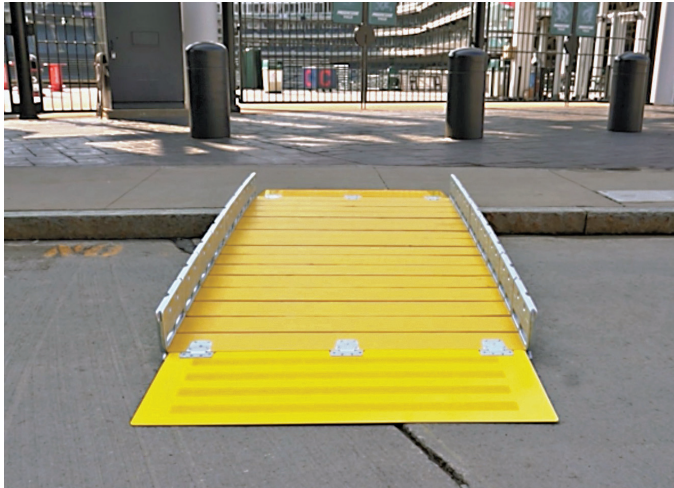
BoardWalk Ramp installed perpendicular to curb.