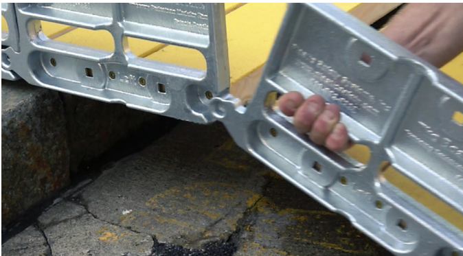
Modular sections connect for ramp length needed. No hardware required to assemble sections.

Please contact your PSS Roadway Safety Consultant or PSS Customer Service for details.