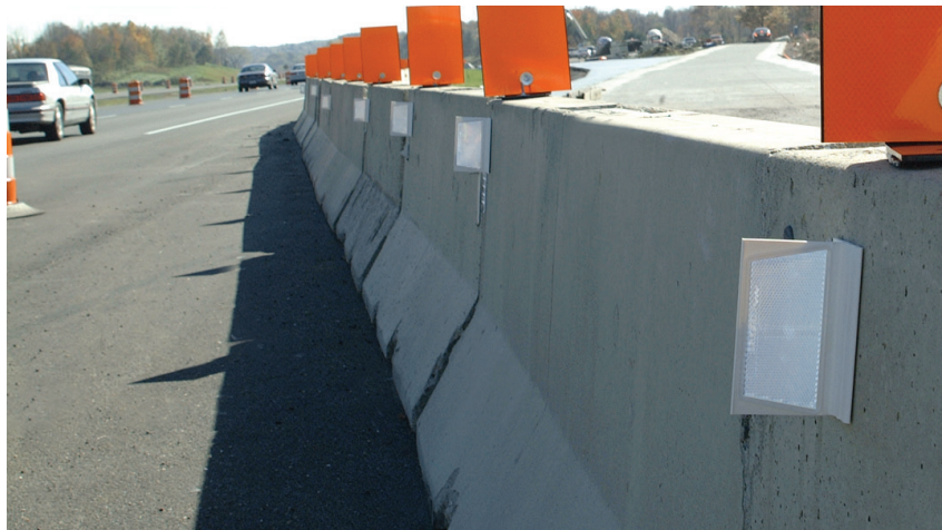
BAM Delineator, clear lens, on side, Quik-Mark Object Marker, on top.