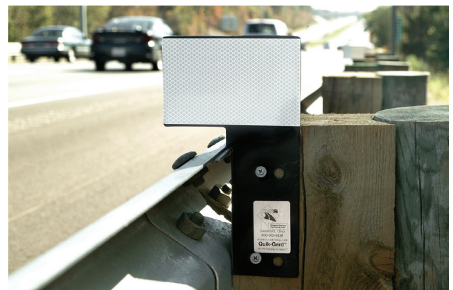
L-type shown above: 4" x 6½" white reflective area.