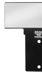
4" x 6½" reflective area Delineator "L"