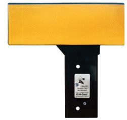
4" x 13" reflective area Delineator "T"