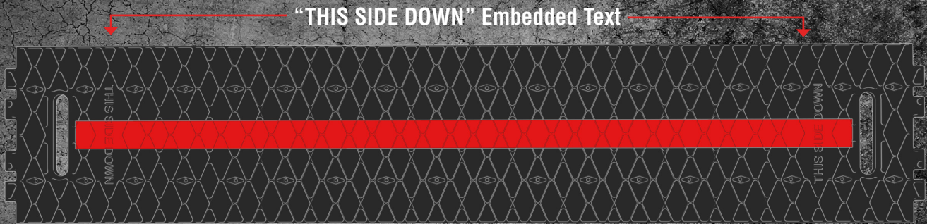
Embedded Text and Red Stripe on Bottom of RoadQuake 2F TPRS (1/2 Strip Shown)

Field tests in active work zones indicate that the warnings effectively direct workers to deploy strips correctly.